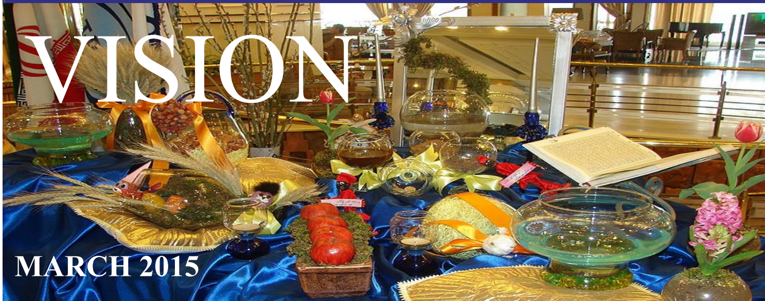
At a Glance...

Sun. July 12 - 10:00 am - 4:00pm Annual OZCF Picnic @ Coronation Park